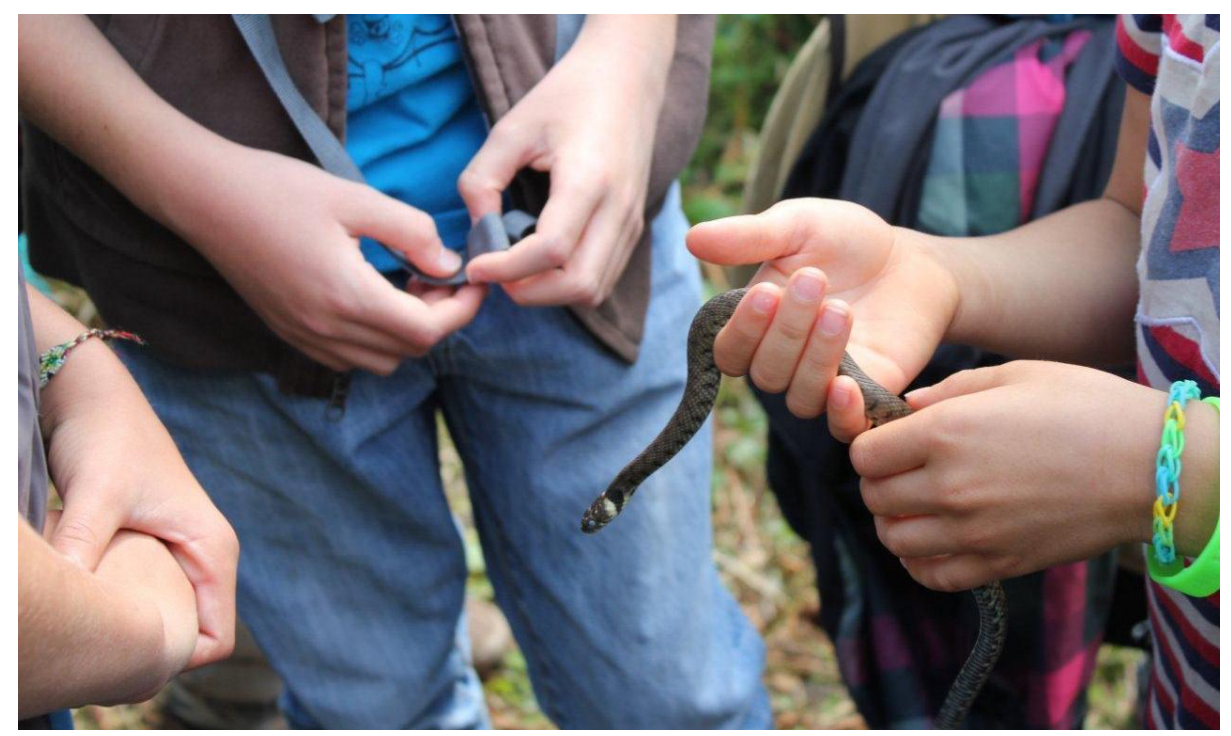
Figure 3: Guided walks for family groups from the local community in conjunction with the RSPB.