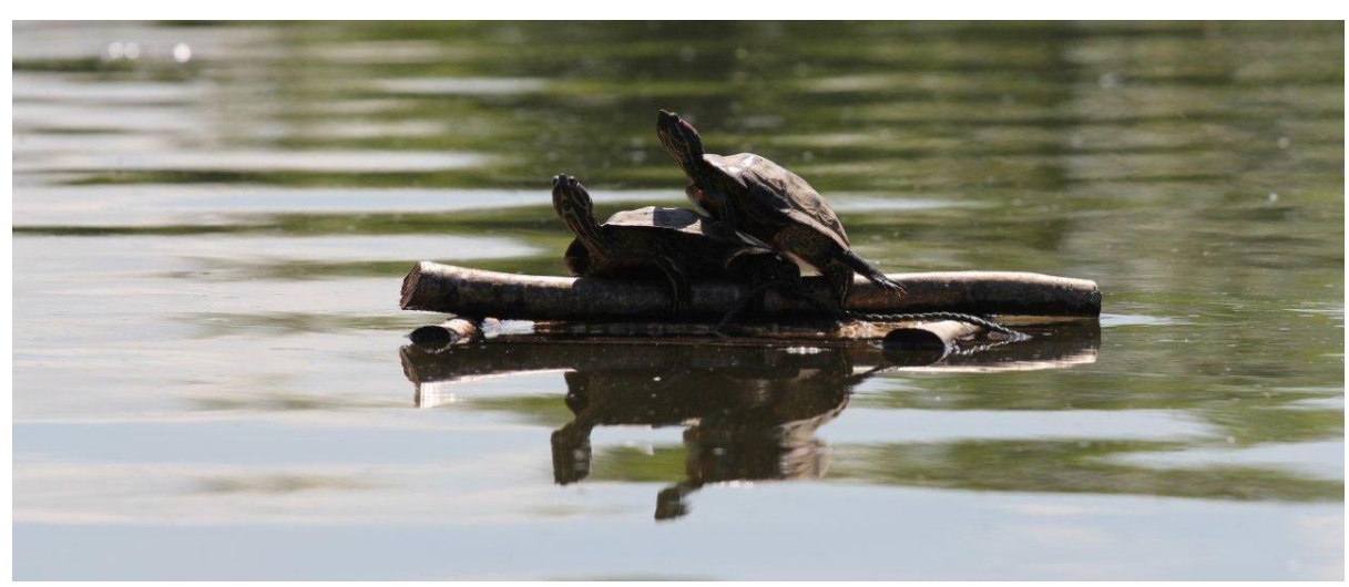
Figure 5: Two new arrivals on the Boating pond May 2015.

23. Terrapins, a species not surveyed in the initial 2009 report, continue to be recorded across the Heath, with a number of new sightings already in 2015 (Figure 5). Whilst they are not currently able to breed in the UK climate, introductions from members of the public continue. About ten terrapins are thought to be present in Heath ponds, down from an estimated 30-40 in 2000. This reduction has partly been due to some harsher winters and partly to a trapping campaign from 2007-2010. Terrapins are currently rehomed in the Barbican Conservatory, where a special pond area has been constructed by the Gardening Team (Figure 6).