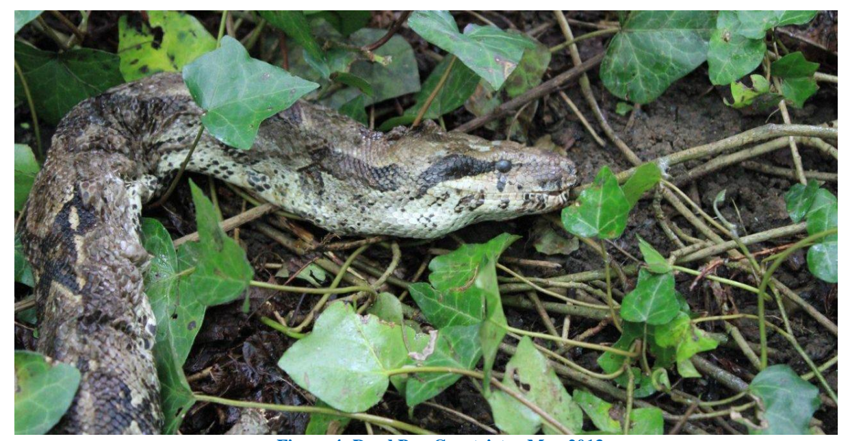
Figure 4: Dead Boa Constrictor May 2013.