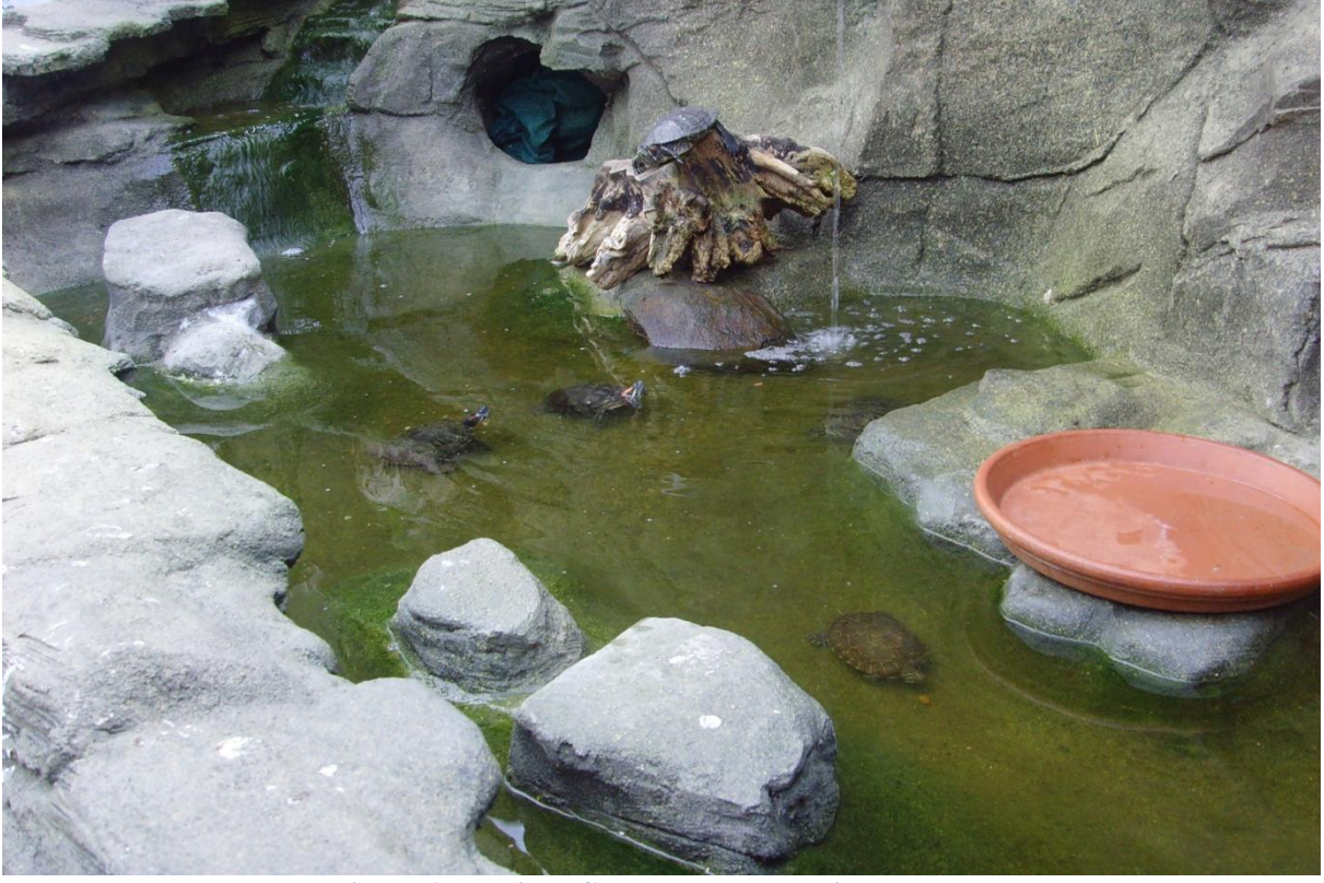
Figure 6: Barbican Conservatory terrapin pond.