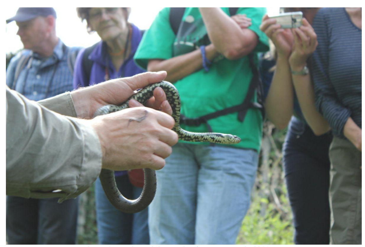
Figure 1: Reptile training session for volunteers in 2011.